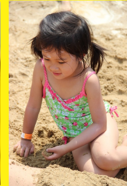
OSA – Are On Site Adventures!