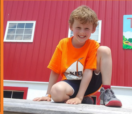
OSA — Are On Site Adventures!